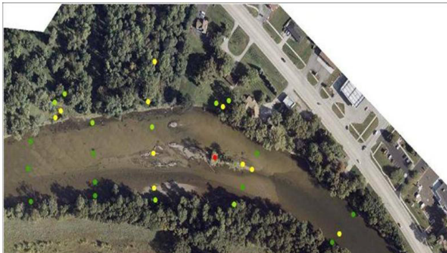
Figure 3 – Aerial photograph of the Reach MM island, 2007.